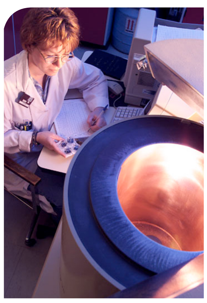
An SRC authorized user is preparing to count samples on a gammacounter

A: We do not provide tours of the lab or the reactor to the general public.