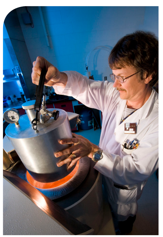
A reactor operator is analyzing a sample of air from the reactor, testing for the presence of fission gases

A: Operation of the SLOWPOKE requires a federal licence granted by the CNSC, which visits us annually.