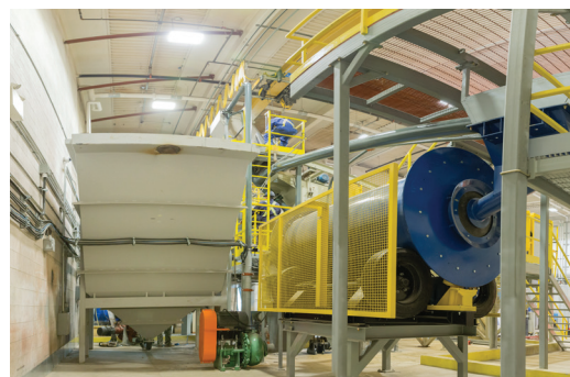
Image of Custom Clarifier installed 10 weeks after design authorization