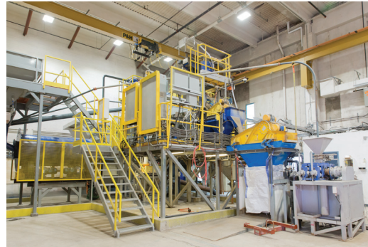
Completion: Physical installation of Kimberlite Ore Processing Facility