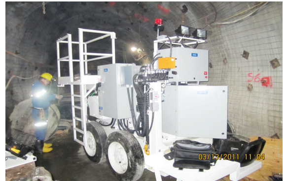
Underground Up-hole Ore Mapping System